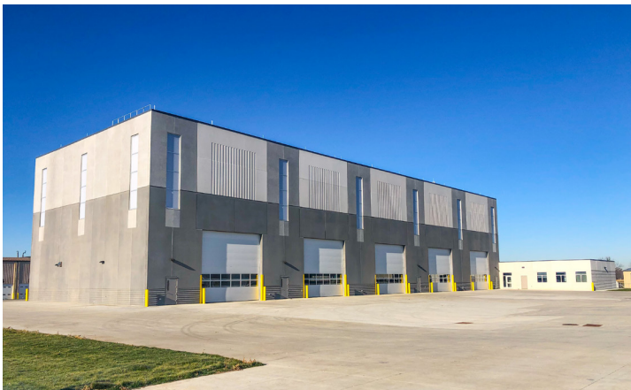
S-48 Vehicle Maintenance Instructional Building, IAARNG Camp Dodge, Johnston, Iowa