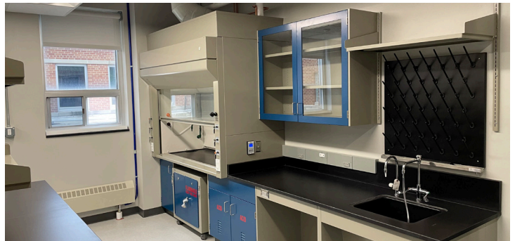
USDA ETSARC Second Floor Bio-Science Lab North Fargo, North Dakota

Schemmer designed a new post office in a vacant Sears retail store. Space was repurposed for the main Council Bluffs, Iowa Post Office. Project included three loading docks, four customer service counters and 1,100 P.O. boxes.