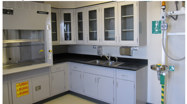
U.S. Army Corps of Engineers POL Operations Building Davis Monthan AFB, Tucson, AZ

Schemmer provided 100 percent design services to renovate 5,400 SF of labs and offices to meet current ARS standards. The project reconfigured and renovated the labs along both sides of the corridor to create six separate BSL-1 labs.