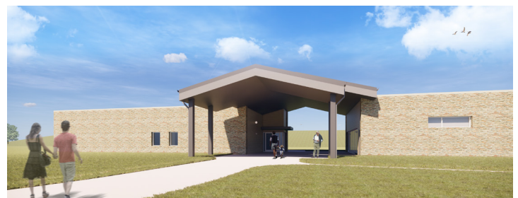
NPS Tallgrass Prairie Visitor Center Entrance and Roof Replacement Redesign, Strong, KS

Schemmer provided architectural, structural and mechanical design as a subconsultant.